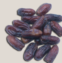
Aseel Dry Dates