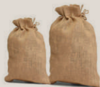
50 Kg Bags (Dry Dates)