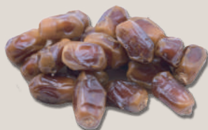
Begum Jangi Dates