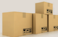
25kg Cardboard Cartons (Dates)