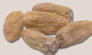
Dhakki Dry Dates